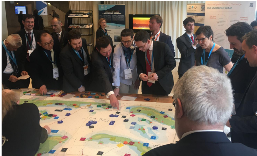
Fig. 1. Impression of the MSP Challenge warm-up board game session in Paris, March 2017.

Challenge's 'learning by doing', or 'learning by playing' approach is both enjoyable and informative for many participants. Although some find the gaming approach to public policy issues such as MSP challenging, there is no doubt that it has stimulated widespread interest and has received overwhelmingly positive reviews. Participants and observers appreciate the gaming format that creates a 'safe place' to develop a better understanding of: